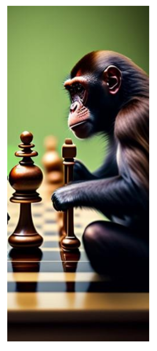
"ai-generated-7794651_1280" by HVARI is licensed under CC0.

Do not show this picture until AFTER the student reads the story. If you show it before, you are teaching the student to guess at words based on the picture. We want to teach the student to use decoding skills.